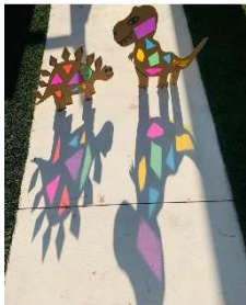
Dinosaur sun catcher!... See more