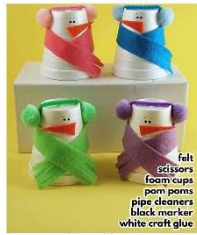
Foam Cup Snowmen

Foam Cup Snowman! CRAFT HERE! -> https://buff... See more