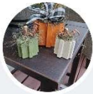
Jenga Block Pumpkin

1st: $6, 2nd: $5, 3rd: $4, 4th: $3, 5th: $2