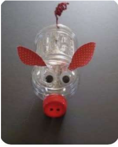
HUNGRY PIGGY PIGGY BANK ...