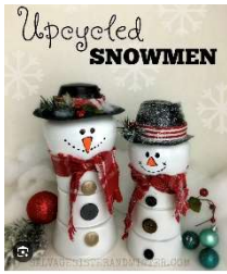
Unstoppables Bottle Upcycled Snowmen ... Visit